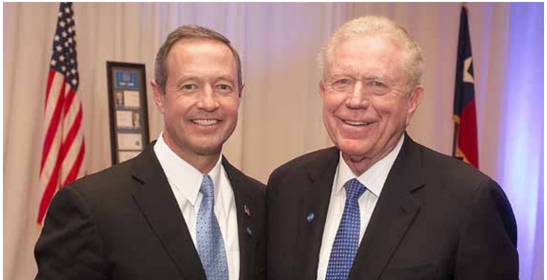
LEGACY KEYNOTE SPEAKER MARTIN O'MALLEY, GOV. OF MARYLAND, AND 2012 TEXAS LEGACY BEN BARNES

Twenty-twelve was a year of change. Last April we moved into our new office on North Lamar, and that was only the beginning. Customized to fit our needs, this professional space provided us room to expand our work.