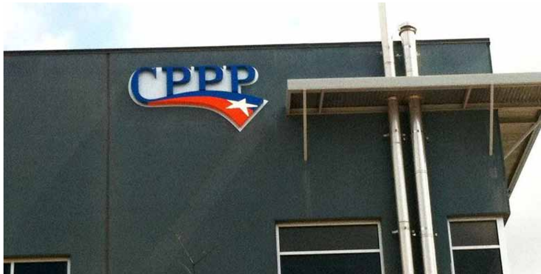
CPPP'S NEW OFFICES. VIEW MORE PHOTOS .