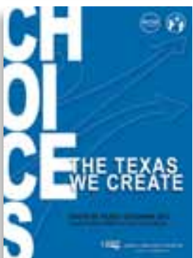
THE COST OF COLLEGE HOW TEXAS STUDENTS AND FAMILIES ARE FINANCING COLLEGE EDUCATION