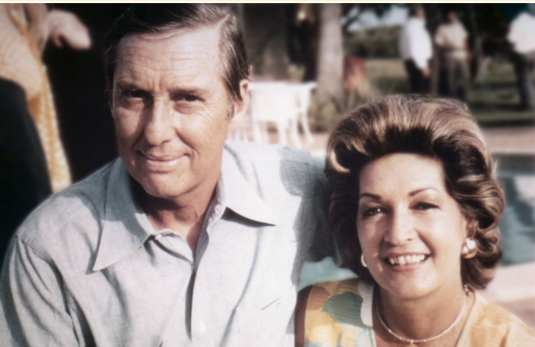
Senator Lloyd and B.A. Bentsen